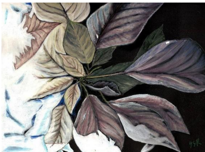
White Poinsettias Tempera Paint (juried show)