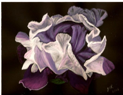
Iris in light Tempera Paint (juried show)

Please e-mail me at info@yriggsartwork.com if you have any question or are interested in purchasing any one of the graphic shown on the left.