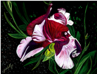
Sunlit Iris Tempera Paint (juried show)

The following four images (approximately 7.75”h x 9.75”w) were reproduced on topnotch paper noted below. I would like to sell them as “Limited Edition” copies (no frame included; you decide what kinds of frame you want at your expense) with my original signature on each print at one-third price of my originals. These prints will last longer than my originals (from 100 to 150 years)! I have only four copies of each image.